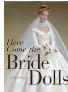
Cover of Louise Fecher's book

OCTOBER 25, 2003 "Brides of the World" Tea...11:30AM Program by Louise Fecher, author of the book, Here Come the Bride Dolls . (Registration Required) Location: T Salon & T Emporium, 11 East 20th Street, NYC