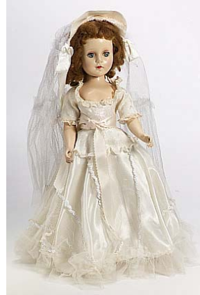
1950's Sweet Sue American Character Walker

"Brides of the World" Tea T Salon & T Emporium 11 East 20th Street, NYC