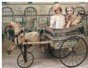
Above: 19 th Century Carved Horse & Wicker Cart with Kestner and K&R dolls - Theriault's auction

Please bring your Summer finds for display.